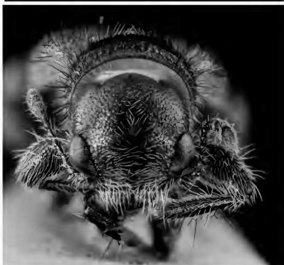
Fig. 5. Dorsal habitus of Enoclerus nigripes dubius Spinola (top) and front of head (bottom). Length 5.5 mm. Specimen is from Dyke Marsh Wildlife Preserve, Fairfax County, Virginia.